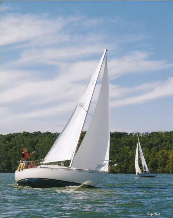
C&C 25 (Mk II)